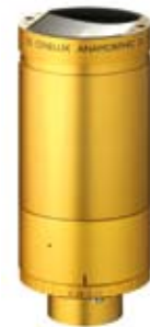
CINELUX PREMIÈRE ANAMORPHIC 1.7/62.5